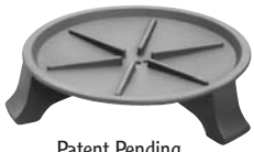
Plant Aqueduct™ 9 1/2" in diameter x 2 1/8" in height

Pottery Trainer Company sells only QUALITY products.